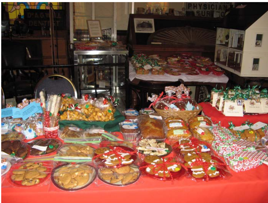
2012 Christmas Bazaar Bake Sale

Christmas at the Mansion, with its lovely decorated rooms, brought many visitors to Gordon Hall. A Holiday Tea was added this year and was enjoyed by all who attended. The revenues raised from these events, plus Civil War Days, contribute to the progress we are making in paying off the Gordon Hall mortgage. Yet, we still have a long way to go.