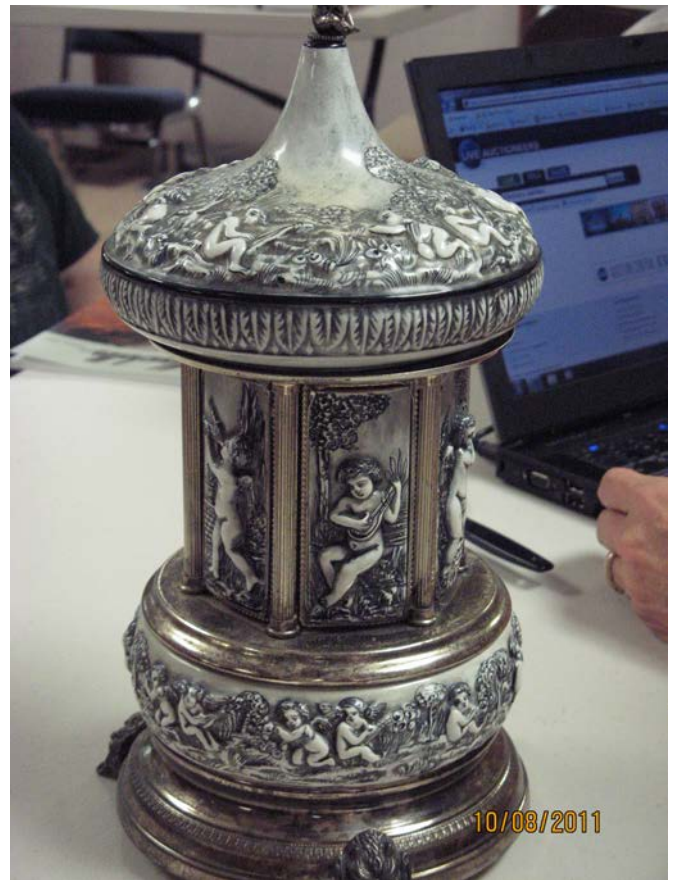
Antique Appraisal Clinic