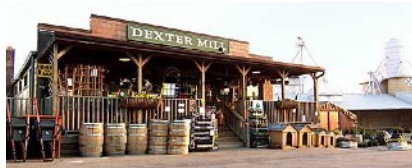
The Dexter Mill Today

In March of 1927 the association became a stock company and changed the name to the Dexter Co-op Company. The Co-op did well even during the depression and started to outgrow their facilities. In 1940 they broke ground on a new building. The new building gave them room to stock more agricultural supplies as well as hardware, dishes and kitchen cabinets. In 1949 a fire destroyed the wooden grain elevator. A new fire resistant elevator was built where the old house had stood.