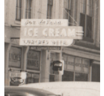
Joe LaRosa Sign @ 1940

The building at 8093 Main Street was built in 1869 following a destructive fire along this block of stores. It was occupied for some time by various drug stores. Since Joe began the confectionery in 1921, this site has continued to be a restaurant. In 1993 a fire caused considerable damage to the building next door and to this building as well. Following the fire it was completely renovated.