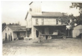
The old house

The Dexter Agriculture Association was organized in November of 1919 for the purpose of eliminating the middleman who they felt charged high prices for farm supplies, but were underpaid for purchasing their grain, produce and livestock. Each farmer put up $50, a considerable some in 1919, and signed a note for an additional $50 to fund the association.