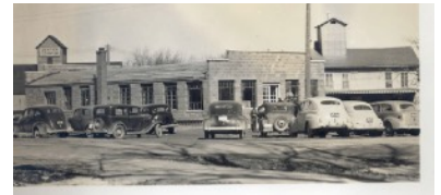
The new building started in 1940

The association bought an old house and five lots on a triangle of land bordered by what currently is Central Street, Third Street and the railroad tracks. The old house on the property was converted into a feed production facility where oats and corn, brought to the mill by local farmers, was ground in the basement. Upstairs, employees shelled corn and produced feed for hogs, chickens and cows. They opened for business on January 1, 1920.