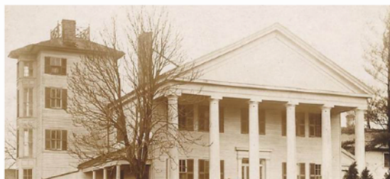
Gordon Hall in about 1900