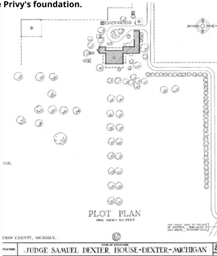
Gordon Hall grounds in 1934 from the HABS drawings

We don't really know exactly how Judge Dexter's farm was laid out. The Historic American Building Survey (HABS) drawings show the buildings that existed in 1934, but it is believed that there had been many alterations by then. The only structures that remain today are Gordon Hall and the Milk House. In many cases, it is believed that the foundations of the lost buildings are still present underground. University of Michigan Archaeology students conducted digs in 2018 and 2019, and they located the northeast corner of the Ell's foundation as well as the Privy's foundation.