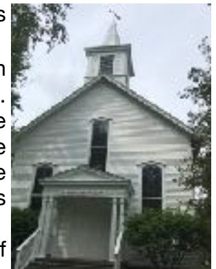
Dexter Area Museum