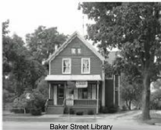
Baker Street Library

In 1971, a second meeting was held in the Library on Baker Street with the hopes of involving some business people, however, only one attended. Various ideas about what the Society could do were discussed and it was decided then to hold a public meeting in July of that year.