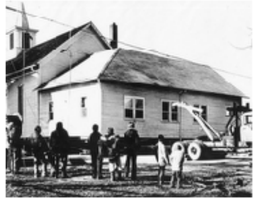
Moving the Church

and on January 25, 1974, the building was on a new basement at the new site. After the relocation, a new roof was put on, plumbing and wiring was installed, sidewalks put in, eaves installed, memorial trees and shrubs were planted and the building's exterior was painted. Two furnaces were added, a new wooden stairwell to the basement was put in and the nine stain glass windows were covered with a plastic, unbreakable, bulletproof sheeting. Other work inside went on included painting and re-plastering. Fran Bosel of Dexter and Dorothy Abbott of Ann Arbor stenciled patterns on the eight window shades in the meeting room. All of the work was done by volunteers and most of the materials were donated by individuals, local organizations and businesses.