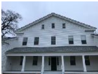
Back of Gordon Hall

We also finished the wood flooring on the