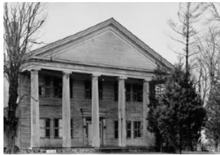
Gordon Hall 1934

In 2000, word came that The University of Michigan had decided to sell Gordon Hall. The DAHS staff began research on the Hall and its history using records in our collection. With this information, we put together a short history of Gordon Hall which follows: