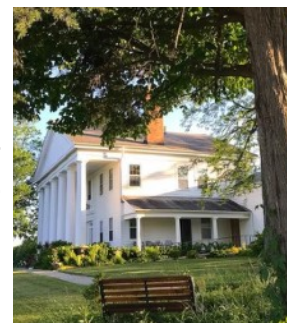
Gordon Hall 2020