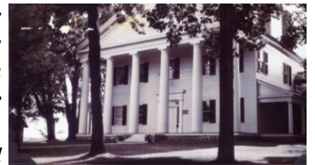
Gordon Hall 1941