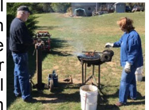
Blacksmith at work

On Saturday and Sunday the 11th and 12th the grounds of Gordon Hall will be full of many interesting presentations. Our local train group will even be in the back tent with a full display!! There will also be tours through Gordon Hall - you will be impressed with all of our new renovations. You will find more information on page 3.