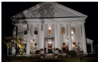
2016 Christmas at the Mansion

In July of 2007, The United Methodist Retirement Community purchased 14.78 acres of the Gordon Hall property from DAHS for a senior citizen retirement community called “The Cedars of Dexter”. This partnership had been under discussion for a long time and their downpayment was put towards our Mortgage payments. The residents of the Cedars formed a “Gordon Hall Friends Committee” to provide assistance and support to the Gordon Hall project.