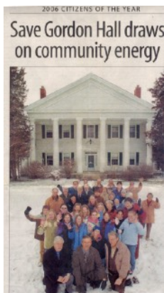
2006 Citizens of the Year