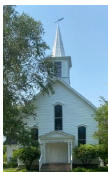
Dexter Area Museum 2021

For the last twenty years, our concentration has been on Gordon Hall, but nothing could have been successful without a strong base and that was the Dexter Area Museum! From being a source of information on Gordon Hall to being collateral for the Gordon Hall mortgage, things wouldn’t have progressed without the Dexter Area Museum. The Museum continued providing tours to different school groups, a few special events such as the “Night at the Museum”, and hosting the Washtenaw County Consortium of Museums and other groups. Although the Annual Pioneer Arts Fair was canceled by the Dexter Tornado in March 2012, the Dexter Heritage Guild continues to sponsor the December Holiday Bazaar, the Antique Appraisal Clinic and other events to support the Museum.