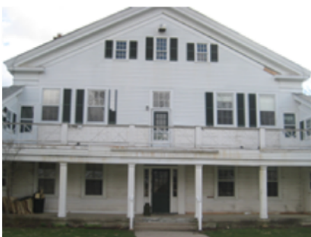
West sunporch removed