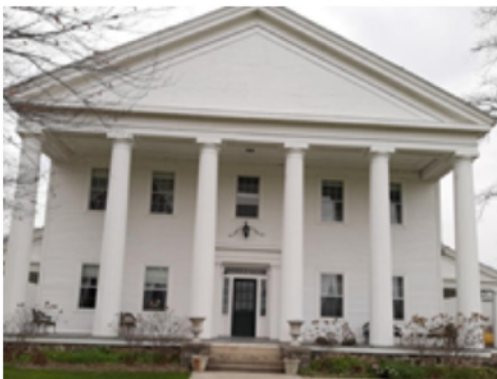
Aluminum siding removed