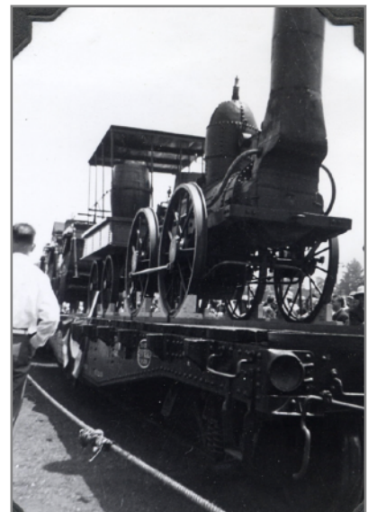
The De Witt-Clinton Train in 1941.

The “Panic of 1837” was a financial crisis in the United States that began a major depression which lasted until the mid-1840s. The effect was felt in this area as the “land speculators” that had prospered in the years prior, were hit hard by the general drop in land prices, and they did not have the money on hand to pay their debts when called upon. We do have some letters from local farmers to their “kin” back East asking for loans as they had purchased their land and now didn’t have money for seed or other necessities, and they were unable to get loans. During this time period, the work had continued on the railroad, and on July 4, 1841 the De Witt-Clinton train came to Dexter. The train brought many changes to Dexter as more people and goods came into town. At the same time, exports of mill products, flour, wool, baskets, as well as agricultural items were sent around the country and eventually to the world.