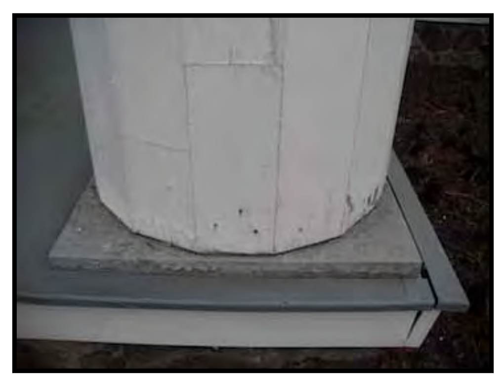
57. BASE OF NORTH EAST PORCH COLUMN.