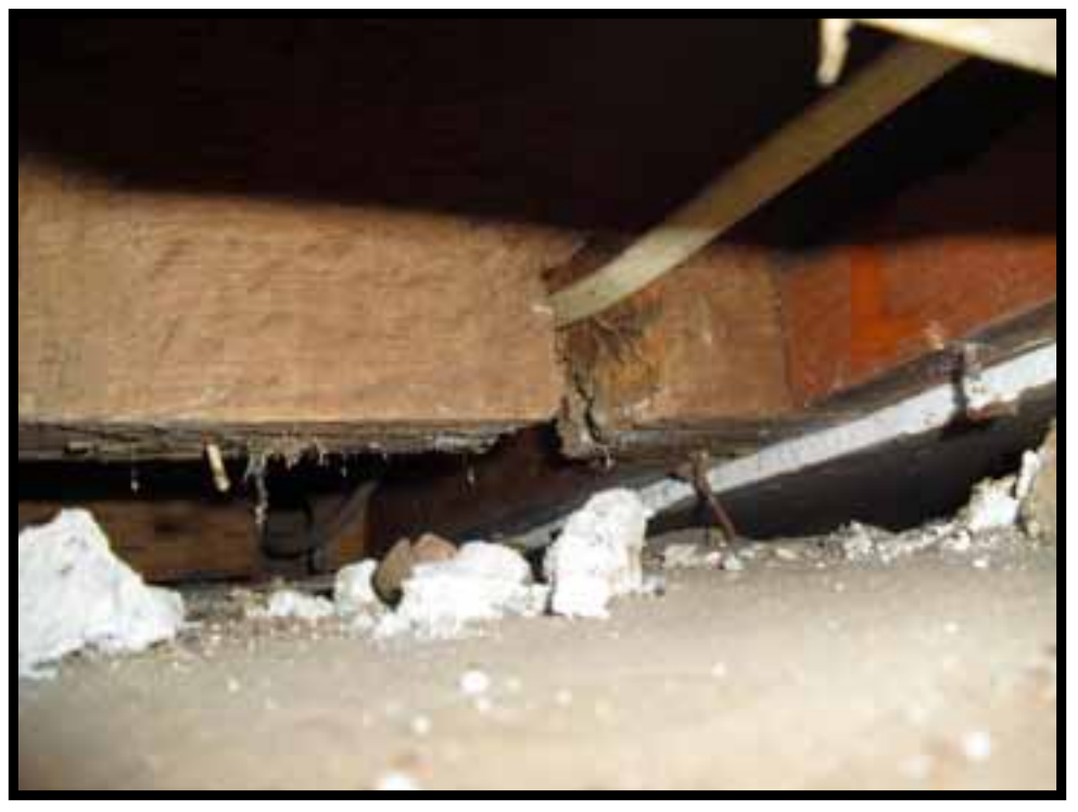
1. 3X10 FIRST FLOOR JOIST NOTCHED NEAR MID-SPAN FOR WIRING.

INSPECTION BY STEPHEN M. RUDNER P.E. / RDA. MARCH 23 - 2011