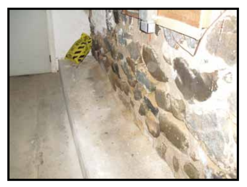
20. WEST WALL OF BASEMENT HAS AREAS OF EXPOSED ORIGINAL MORTAR THAT IS VERY SANDY AND IS FALLING OUT OF THE JOINTS BETWEEN THE STONES.