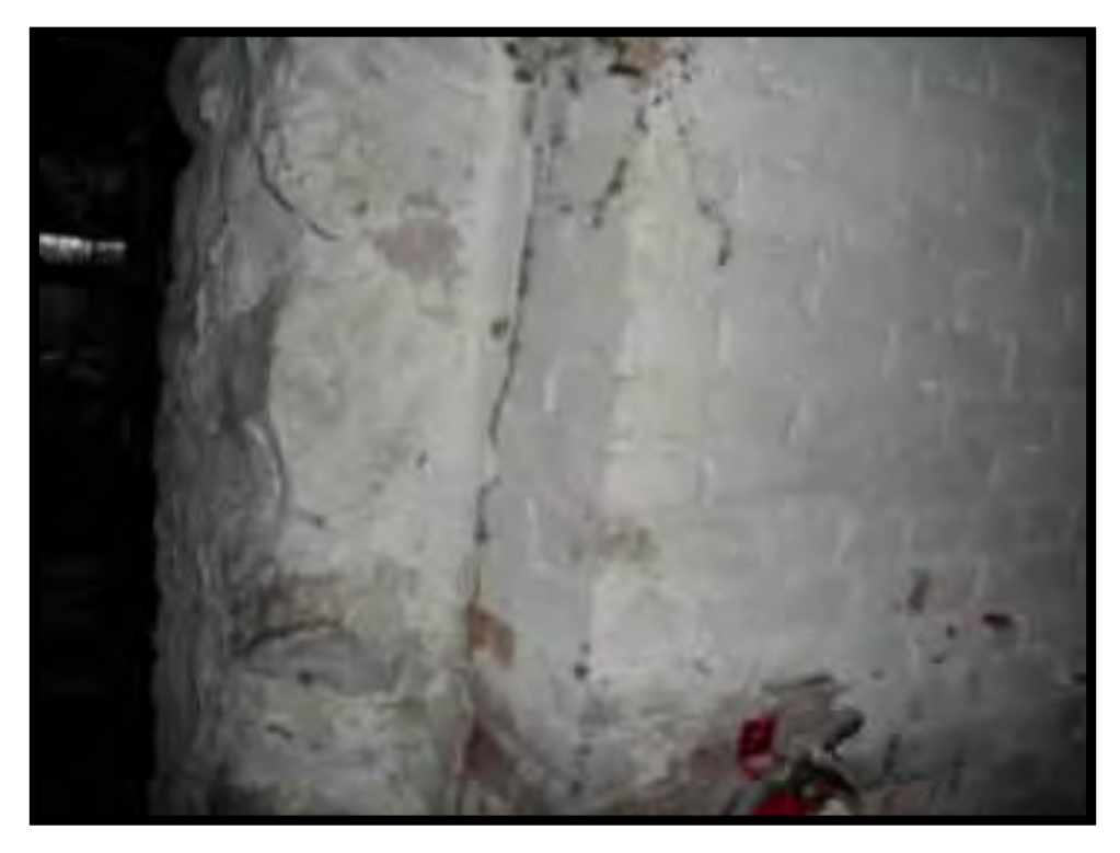
22. CRACK BETWEEN NORTH WEST BRICK CHIMNEY AND STONE FOUNDATION WALL.