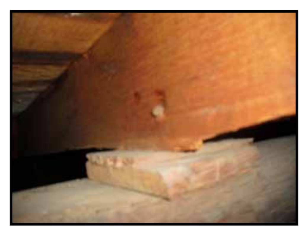
43. TYPICAL ATTACHMENT OF RAFTER TO TOP OF BEAM HAS SHIM PLUS A SINGLE TOE NAIL.