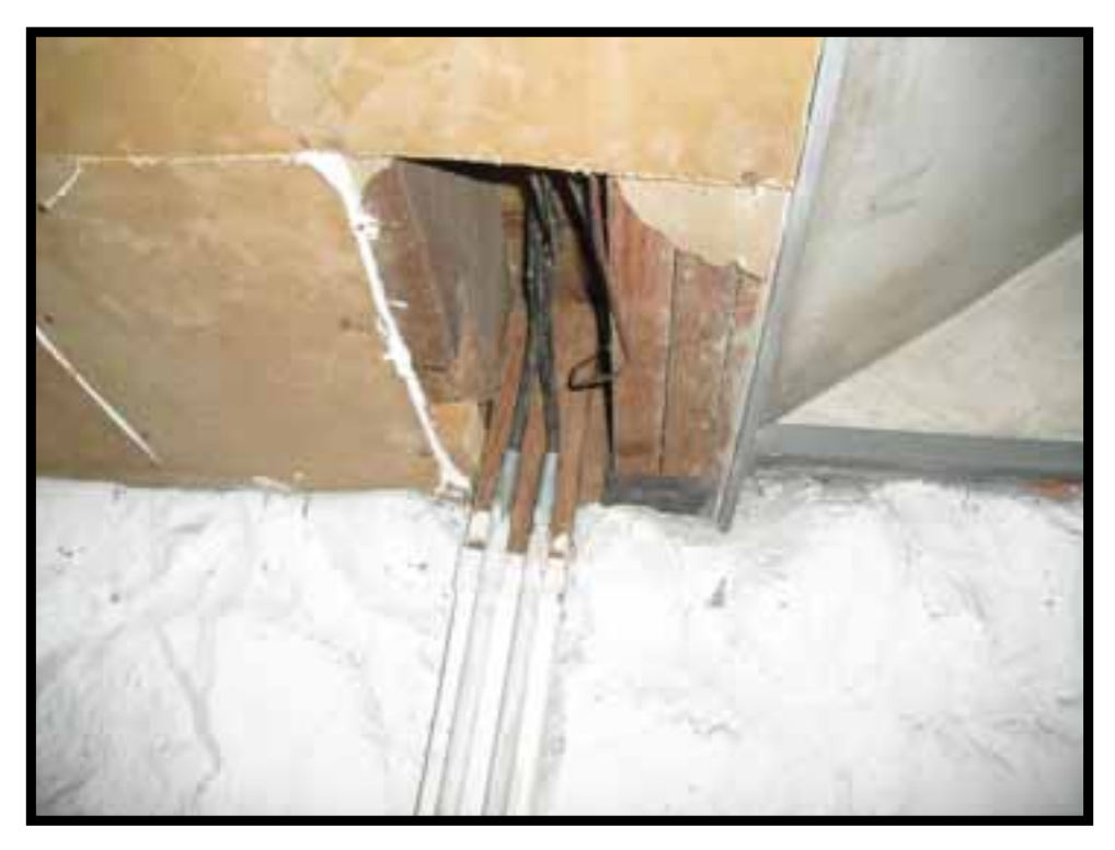
15. NON ORIGINAL (2)2X10 HEADER AT NON ORIGINAL STAIR OPENING FROM FIRST FLOOR TO BASEMENT.