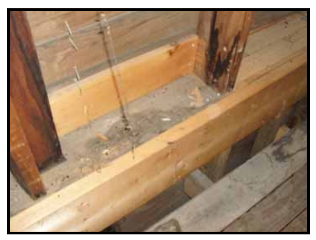
39. EAST GABLE END WALL NEAR ATTIC FLOOR. NOTE: ATTIC FLOOR JOISTS FRAME TO SIDES OF WALL STUDS. IRREGULAR SPACING OF STUDS AND FLOOR JOISTS.