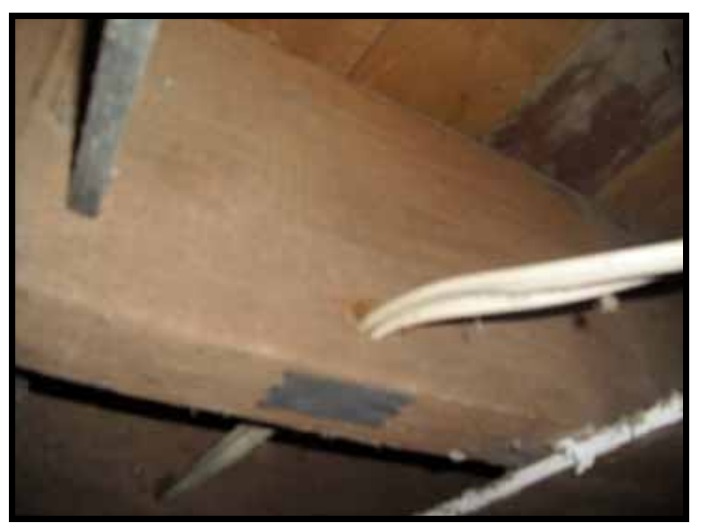
2. 3X10 FIRST FLOOR JOIST WITH HOLES NEAR BOTTOM OF MEMBER NEAR MID-SPAN.