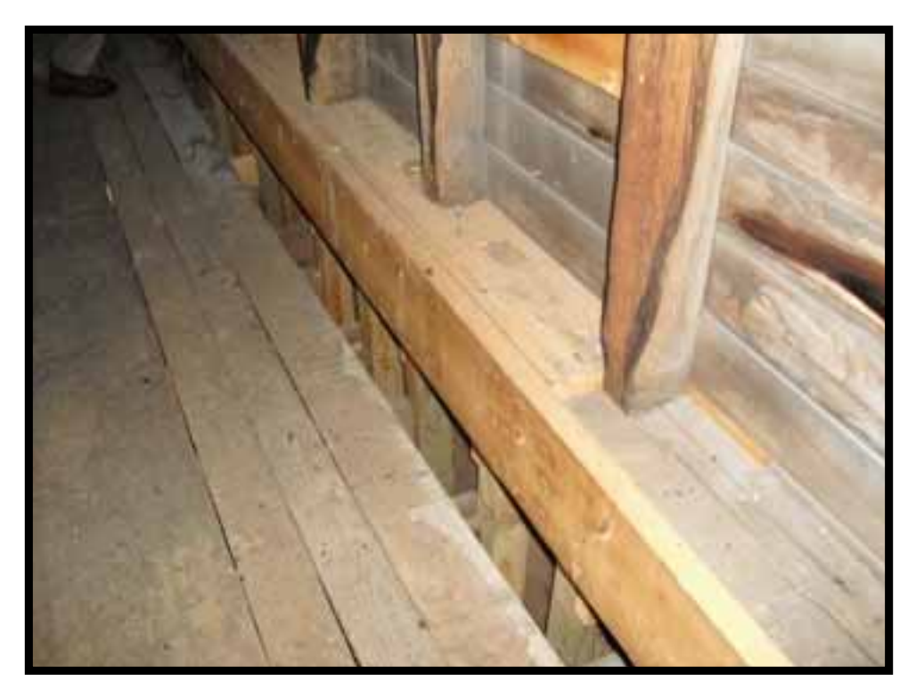
38. EAST GABLE END WALL NEAR ATTIC FLOOR. NOTE: ATTIC FLOOR JOISTS FRAME TO SIDES OF WALL STUDS. IRREGULAR SPACING OF STUDS AND FLOOR JOISTS.