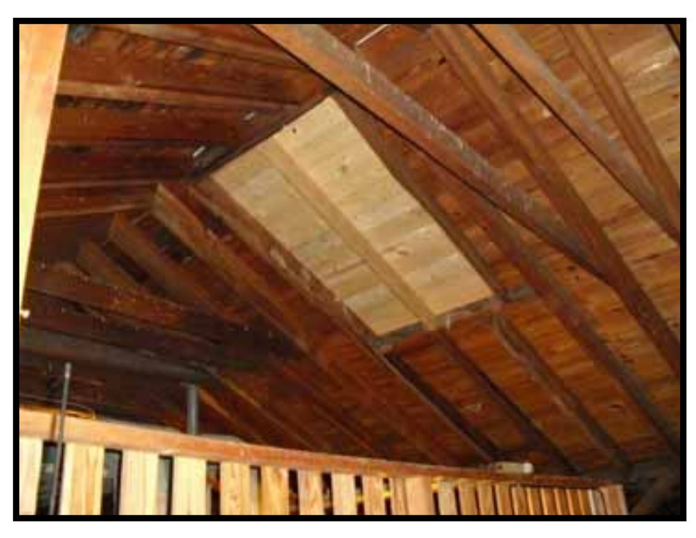
31. MOST RAFTERS HAVE COLLAR TIES EXCEPT AT AREA OF FORMER SKYLIGHT.