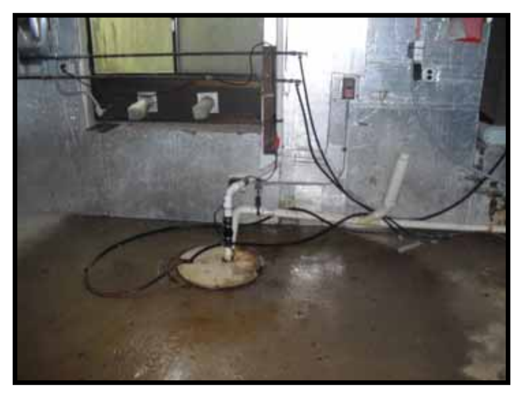
13. DISCONNECTED LINE FROM SUMP SPRAYING WATER IN N-W CORNER BASEMENT ROOM.