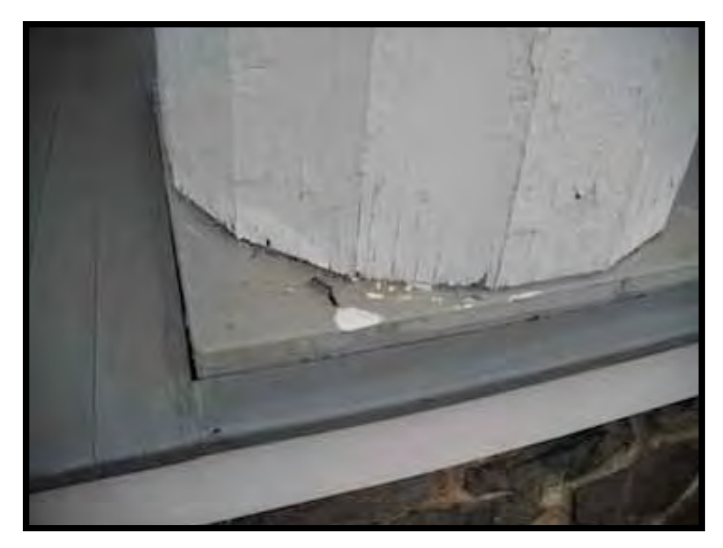
59. BASE OF EAST PORCH COLUMN.