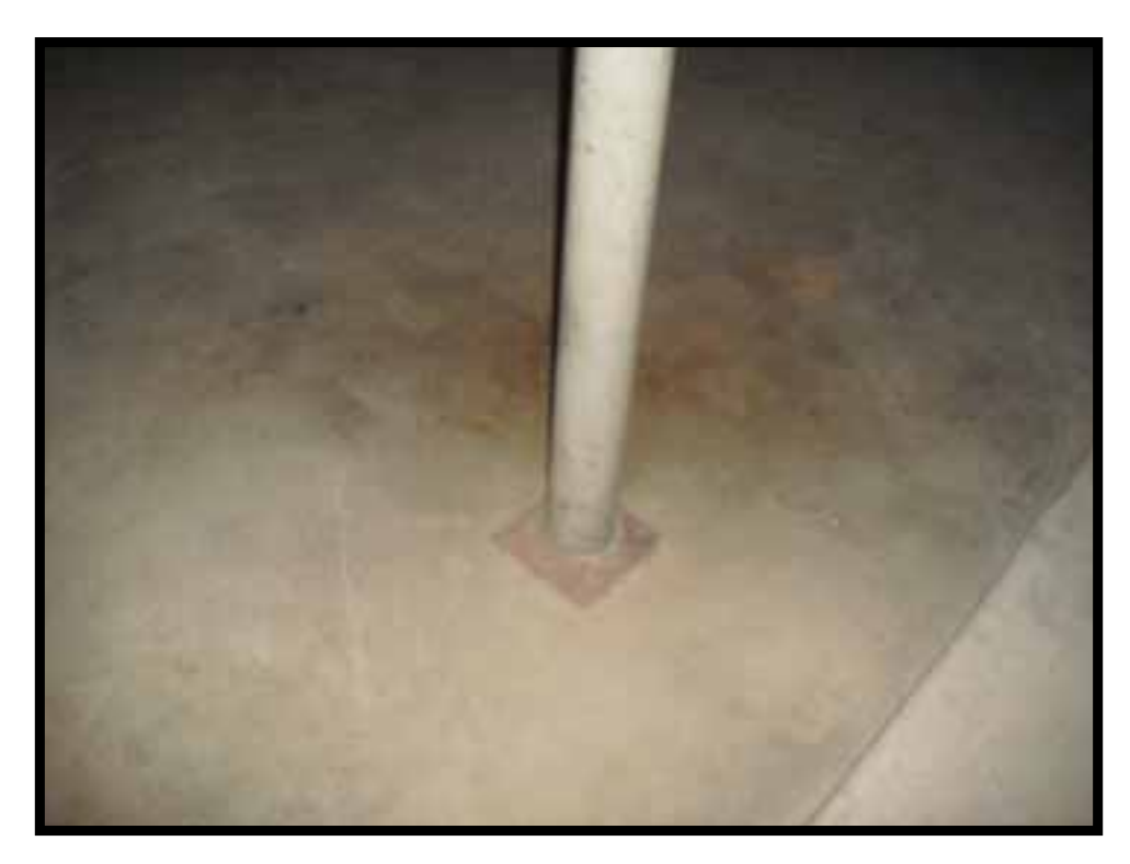
17. COLUMN BASE PLATE AT BEAM SEEN IN PHOTO 16 SITS ON FLOOR SLAB, NOT ON A FOOTING.