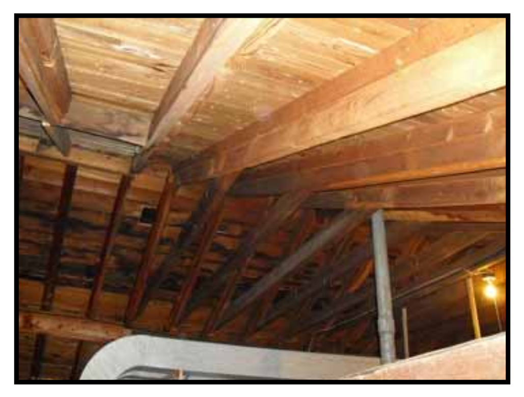
53. ROOF RAFTERS HAVE SECOND 2X MEMBER SISTERED ON ONE SIDE. PERHAPS TO STRAIGHTEN THE ROOF DECK BOARDS.