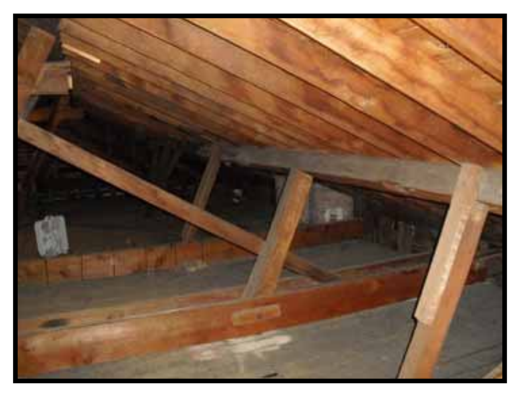
25. ROOF FRAMING LOOKING SOUTH EAST. NOTE NUMEROUS NON ORIGINAL BEAMS ABOVE ATTIC FLOOR SUPPORTING ROOF STRUCTURE AND HANGING ATTIC FLOOR STRUCTURE.