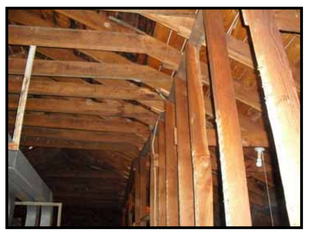
24. ROOF FRAMING LOOKING EAST.