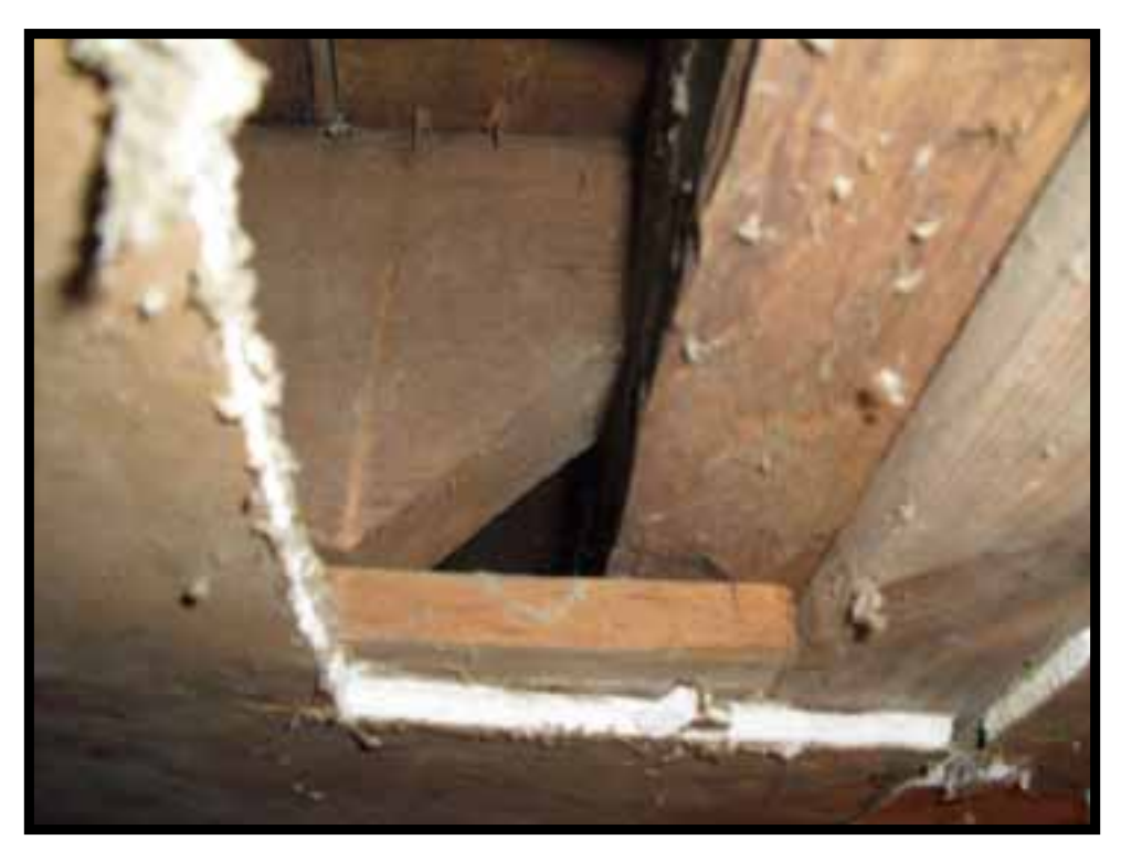
11. JOISTS ABOVE S-W CORNER BASEMENT ROOM MORTISE INTO CENTRAL BEAM.