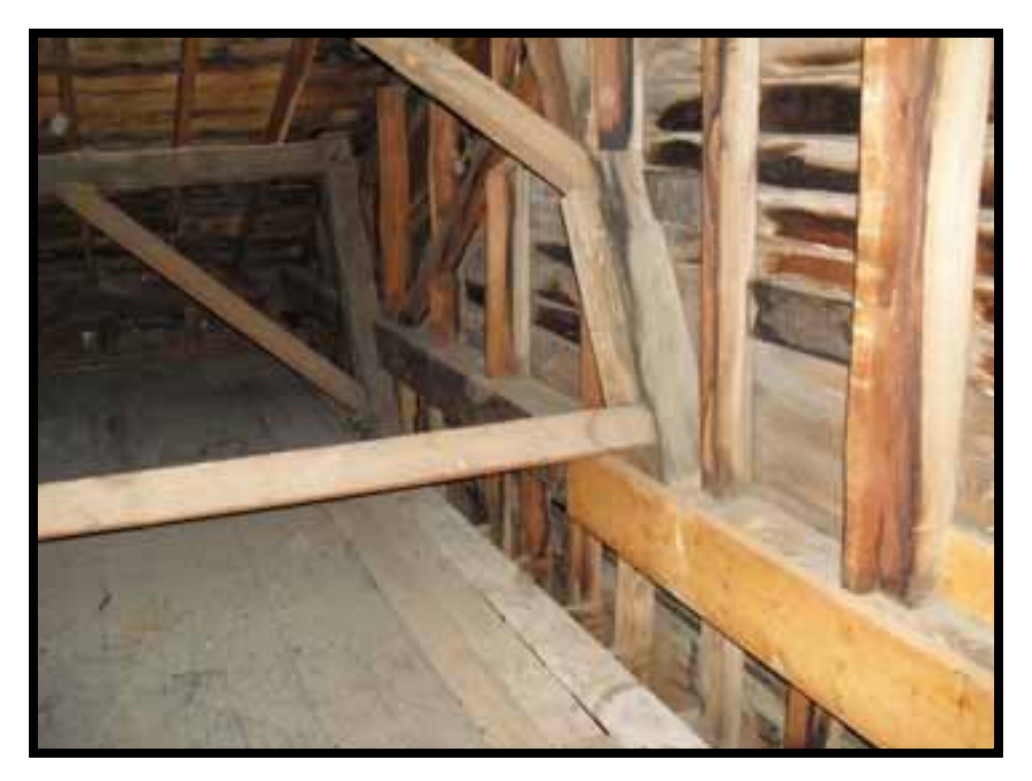
49. EAST GABLE END WALL.