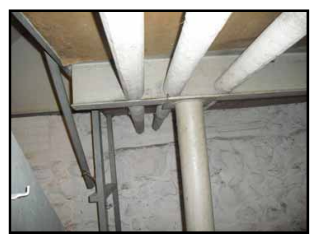
16. NON ORIGINAL I BEAM SUPPORTS JOIST AT EDGE OF ORIGINAL STAIR OPENING TO BASEMENT WHICH IS CURRENTLY FLOORED OVER.