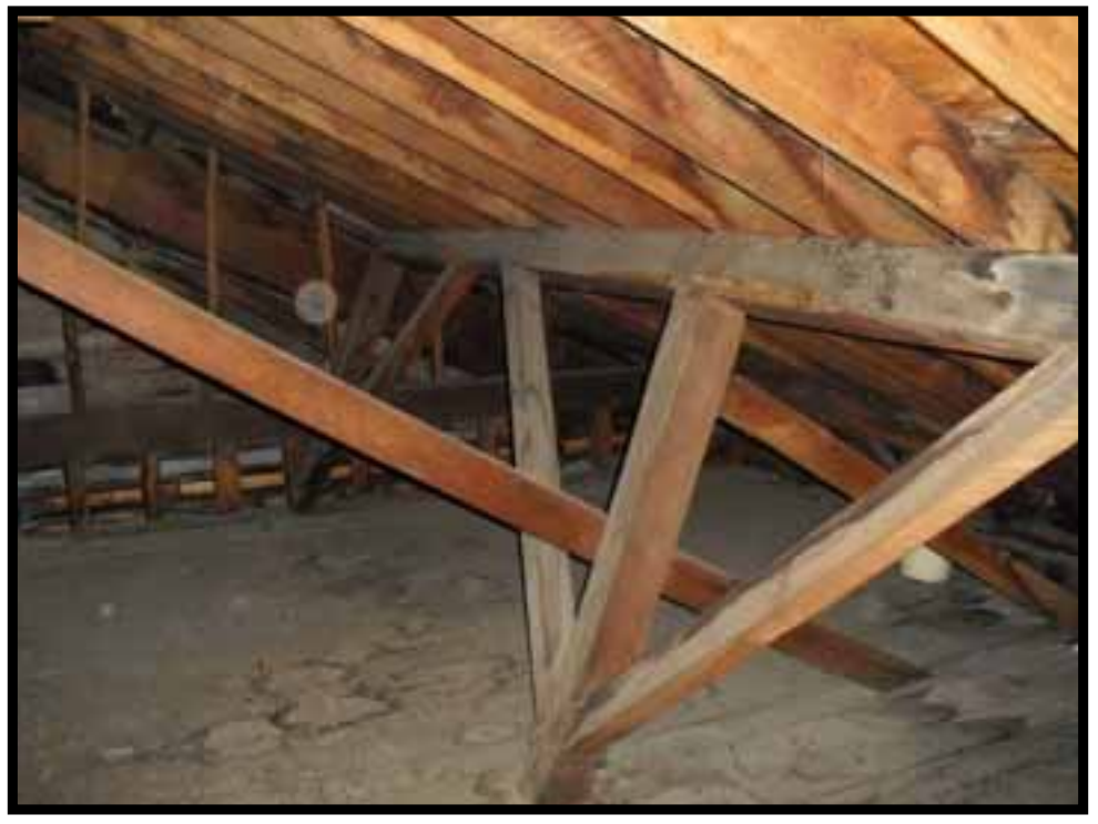
30. LOOKING SOUTH EAST AT ROOF FRAMING IN SOUTH EAST CORNER OF ATTIC.