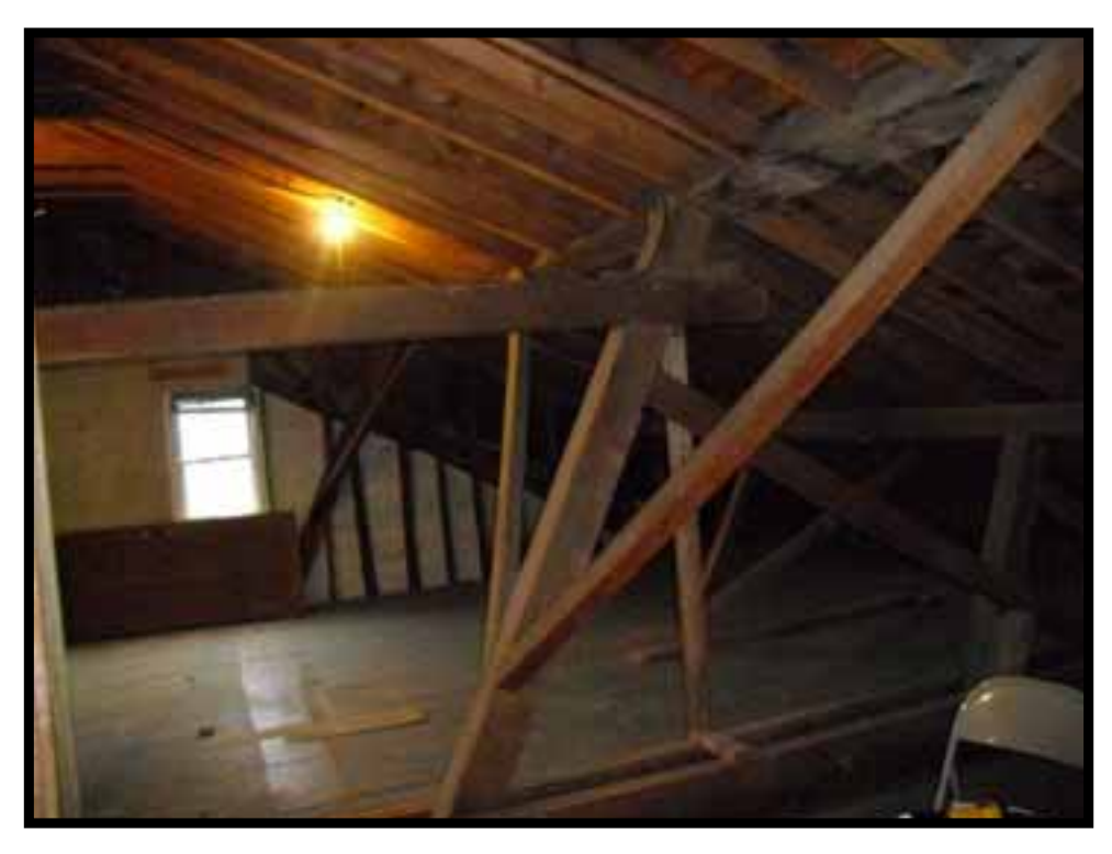
35. LOOKING NORTH WEST AT ROOF FRAMING IN NORTH WEST CORNER ATTIC.