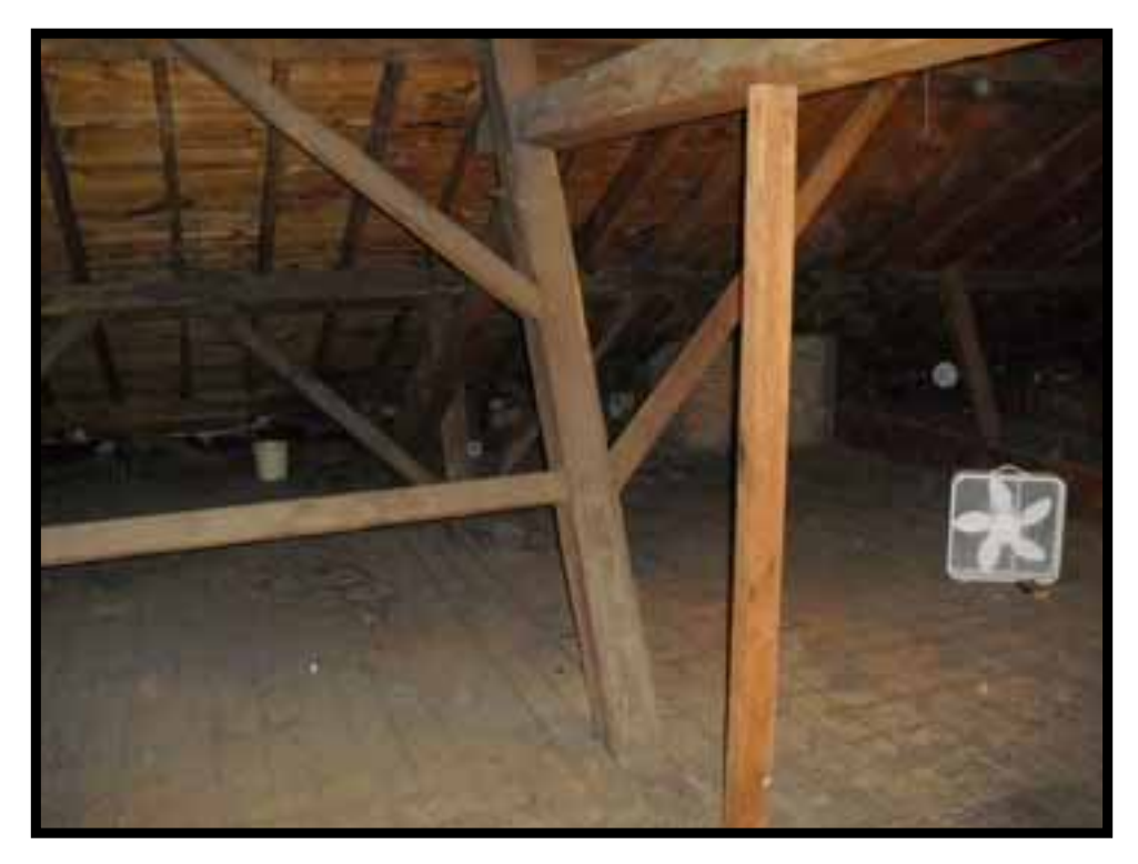
50. ATTIC FLOOR AND ROOF FRAMING LOOKING NORTH.