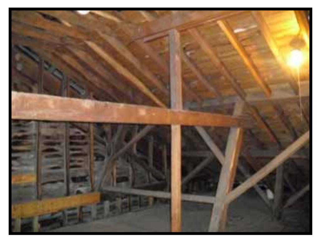
42. FRAMING IN SOUTH EAST CORNER OF ATTIC.