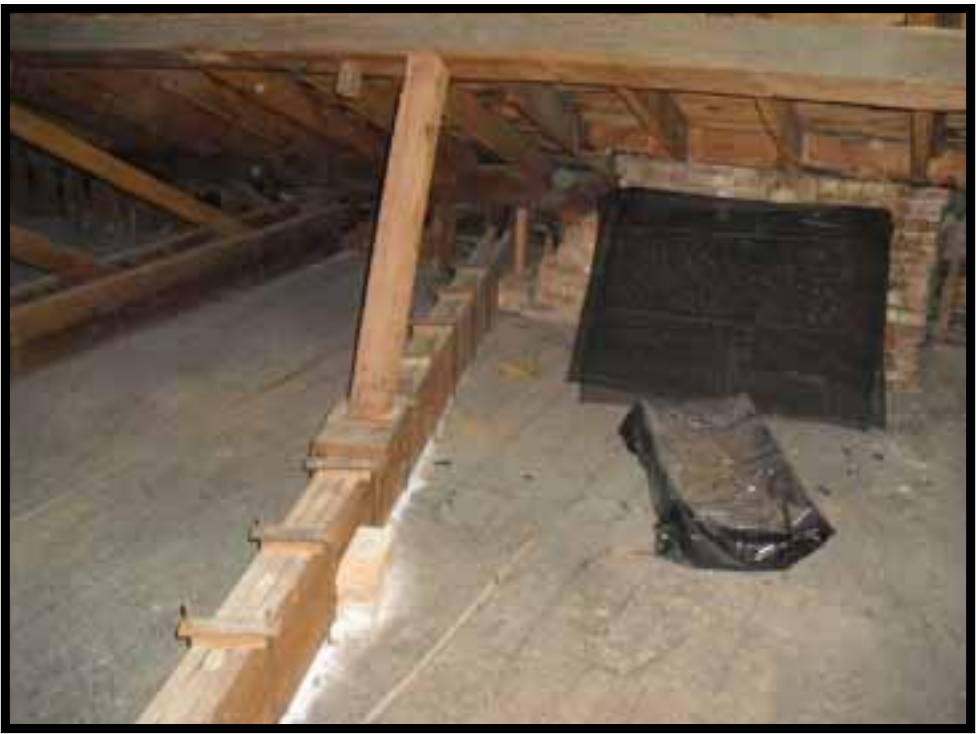
40. NON ORIGINAL FLOOR BEAM ABOVE ATTIC FLOOR HANGS ATTIC FLOOR JOISTS AND SUPPORTS INCLINED COLUMN FROM ROOF PURLIN. THIS IS LOOKING NORTH.