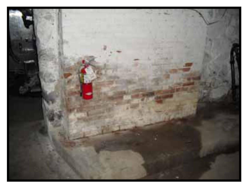
21. WATER LEAKING FROM NORTH WEST CHIMNEY.