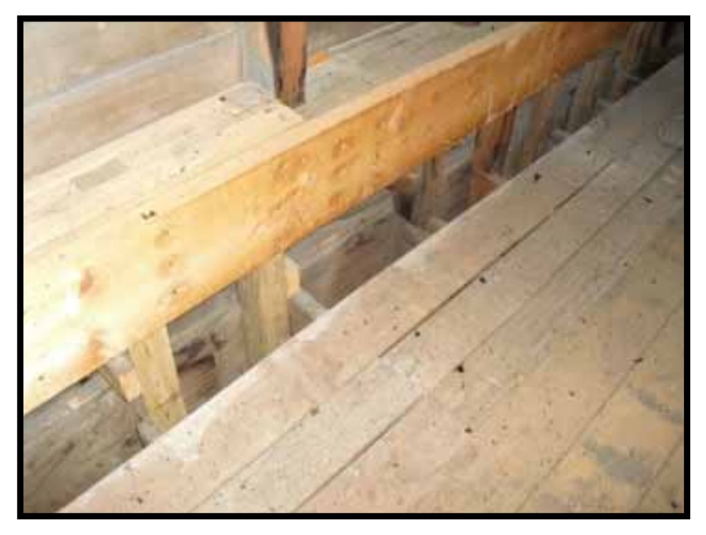
47. SUPPORT OF ATTIC FLOOR JOISTS AT EATS GABLE END WALL.