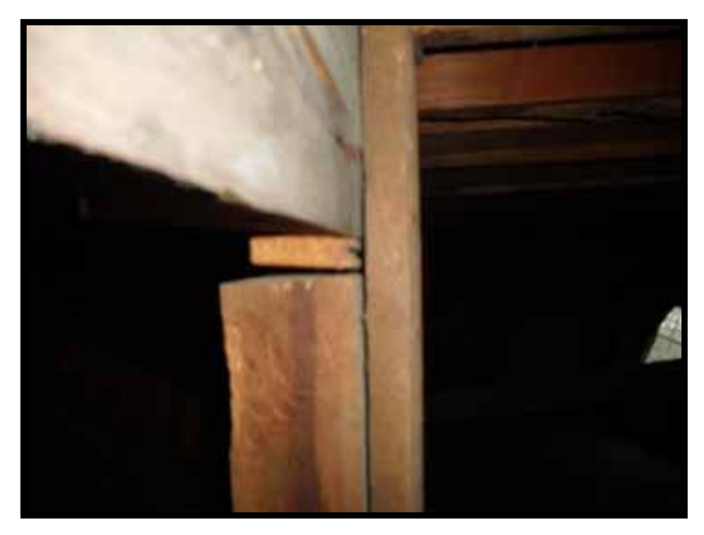
41. POOR CONTACT BETWEEN ROOF PURLIN AND INCLINED COLUMN.