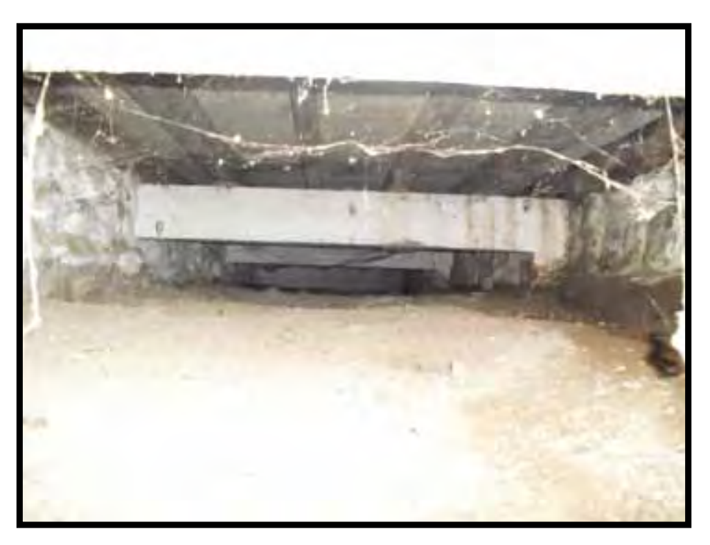
14. CONCRETE BEAMS SUPPORT WOOD FLOOR JOISTS OF THE NORTH PORCH. OTHER PORCHES ARE SIMILAR.