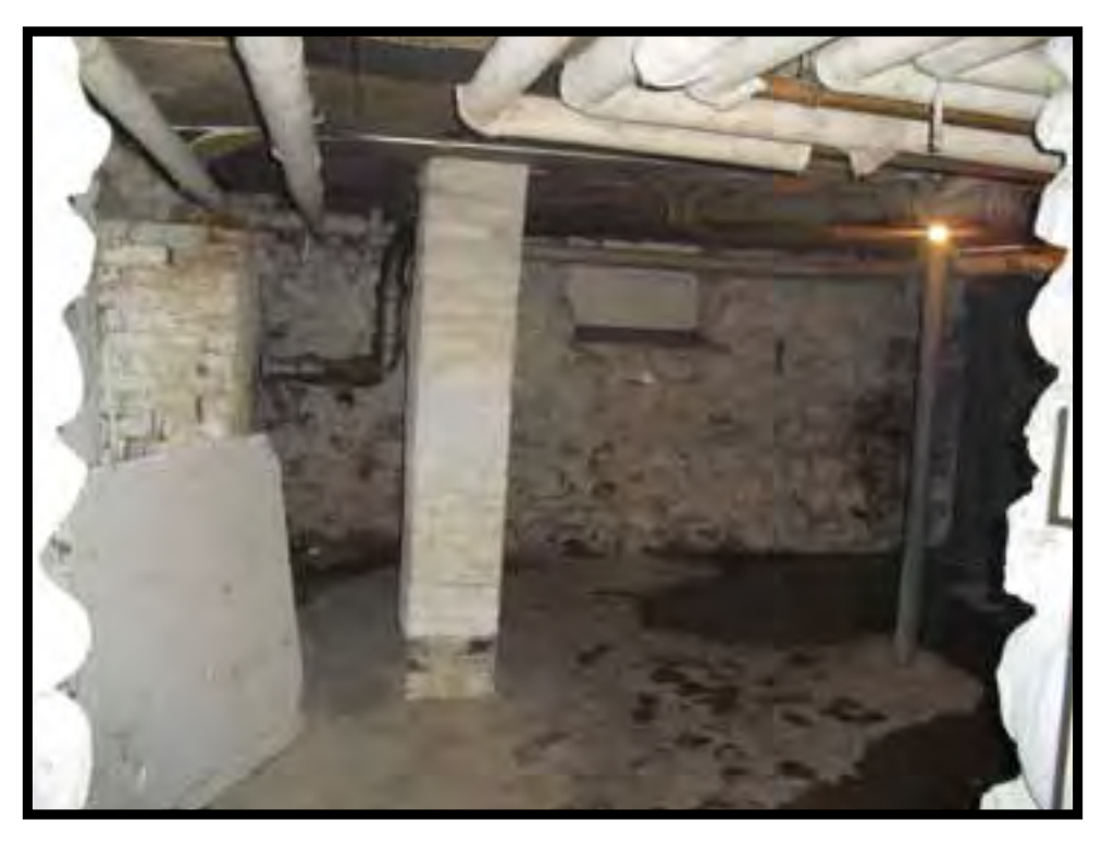
7. SOUTHWEST CORNER BASEMENT ROOM LOOKING SOUTH WEST. NOTE WATER ON FLOOR AROUND CELLAR DOOR.