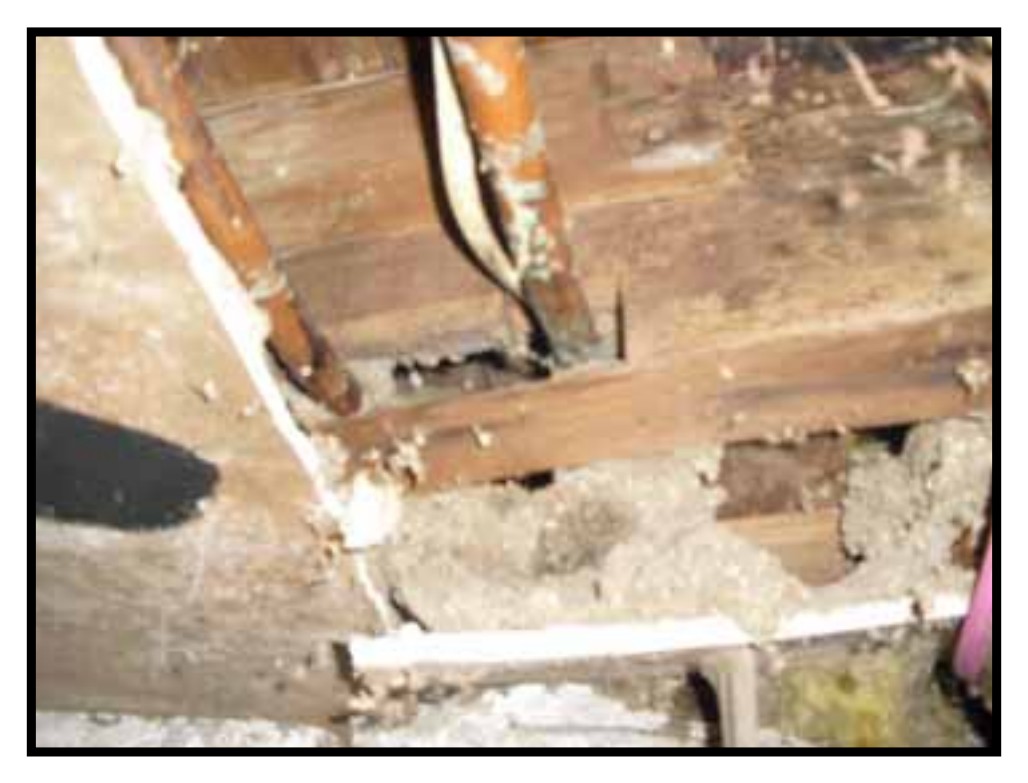
8. PLUMBERS HAVE DAMAGED FIRST FLOOR JOISTS IN SOUTHWEST CORNER ROOM.