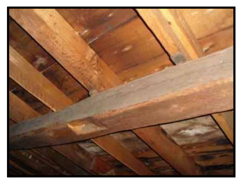
52. ROOF PURLINS APPEARS TO HAVE BEEN RE USED DUE TO JOIST HOLE WITH NO MEMBER FRAMING IN.