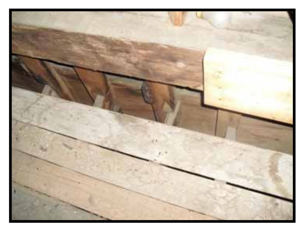
48. SUPPORT OF ATTIC FLOOR JOISTS AT EATS GABLE END WALL.