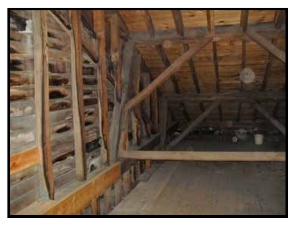
51. ATTIC FLOOR AND ROOF FRAMING LOOKING SOUTH NEAR EAST GABLE END WALL.