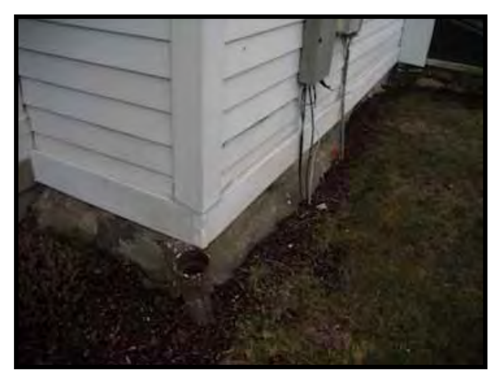
69. FOUNDATION AT NORTH WEST CORNER OF SOUTH WEST WING.