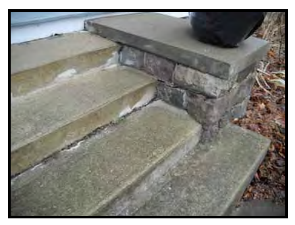
65. STONE WALL FLANKING EAST EXTERIOR STAIRS.