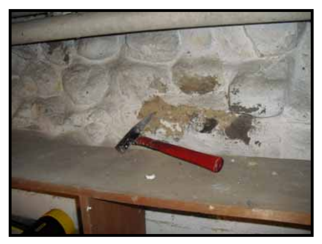
5. QUALITY OF ORIGINAL MORTAR IS LIKE DAMP SAND.