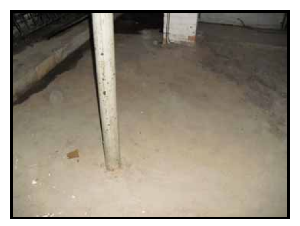
19. COLUMNS SUPPORTING 8X8 TIMBER BEAM SEEN IN PHOTO 18 DISAPPEAR INTO SLAB AND ARE LIKELY SUPPORTED ON FOOTINGS.