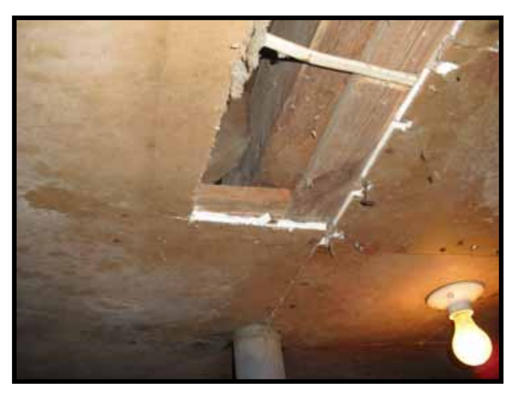
10. CENTRAL TIMBER BEAM IN S-W CORNER BASEMENT ROOM SPANS EAST WEST AND IS SUPPORTED BY PIPE COLUMN AND BRICK PIER. JOISTS MORTISE IN.