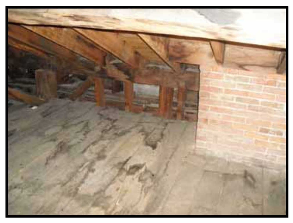
29. ATTIC FLOOR BOARDS AND ROOF FRAMING SHOW EVIDENCE OF PAST WATER LEAKAGE BUT WERE DRY DURING MY INSPECTION.