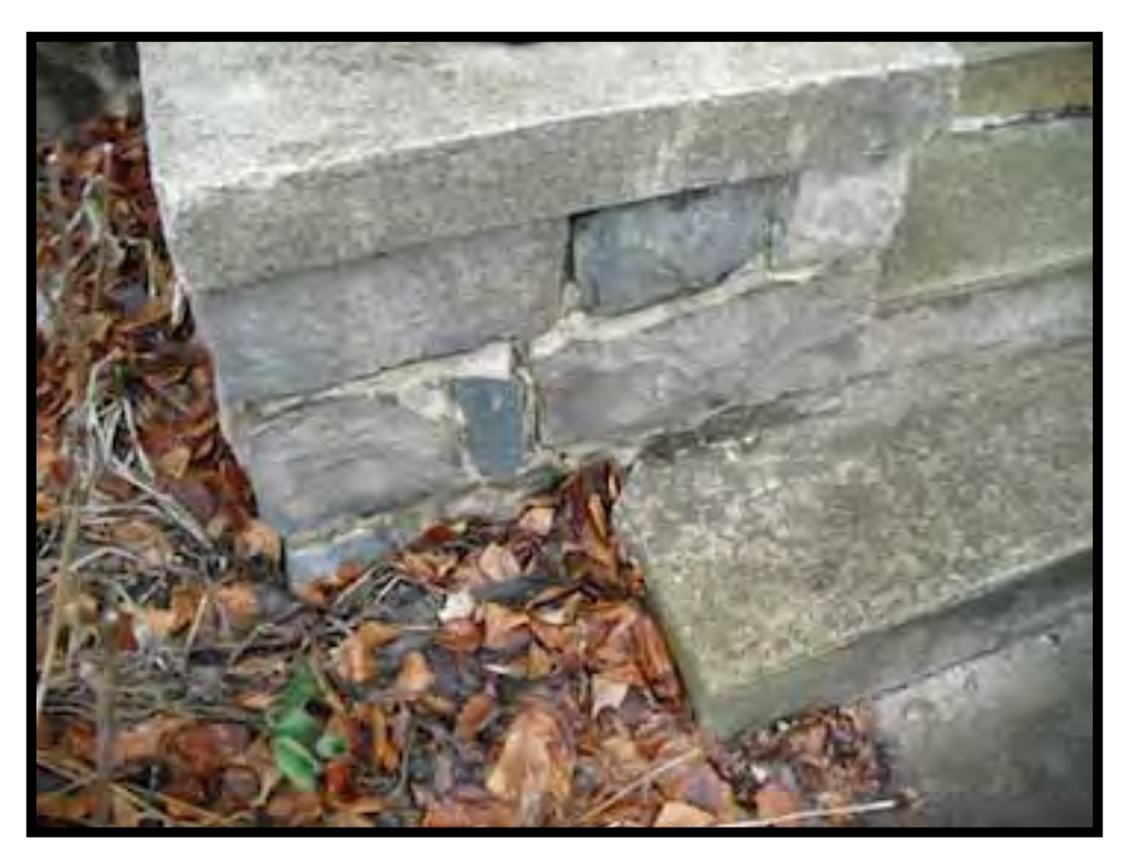
64. STONE FLANKING EAST EXTERIOR STAIRS.