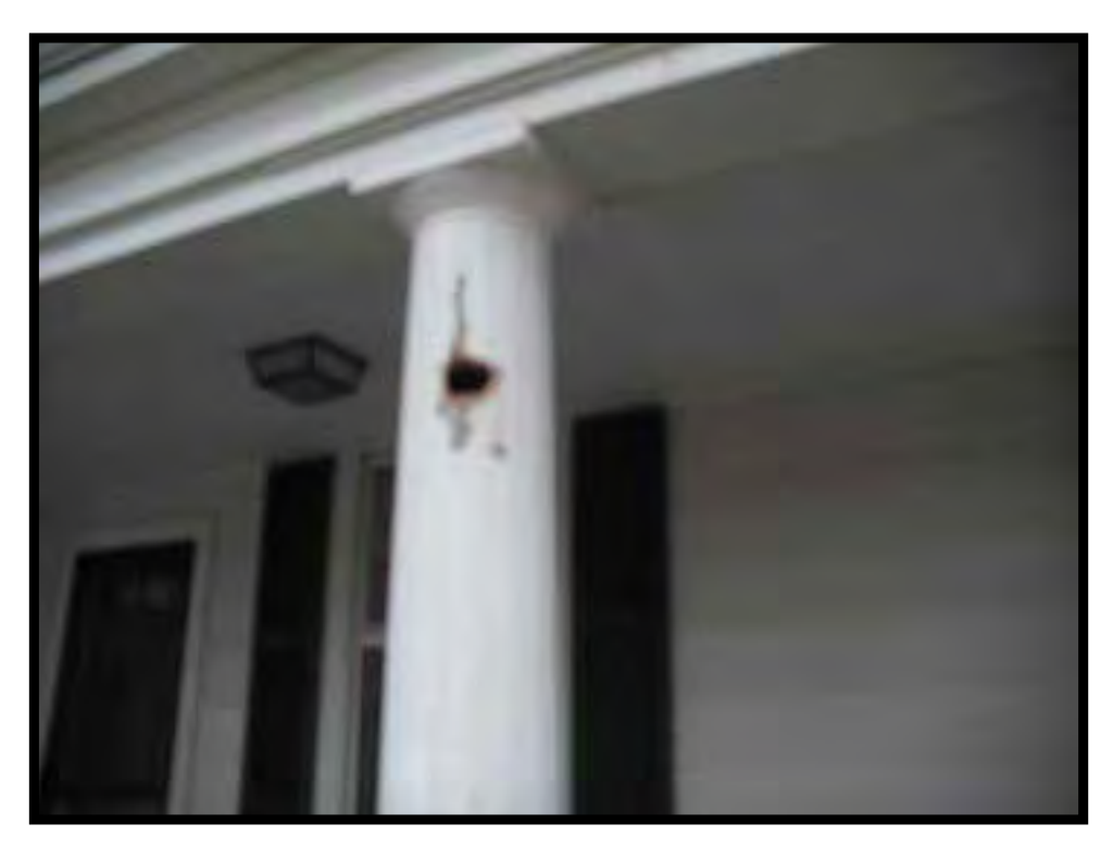
62. SOUTH PORCH COLUMN.