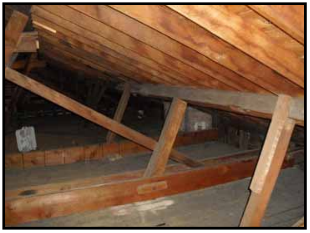
26. ATTIC FLOOR LOOKING EAST. NOT NON ORIGINAL BEAMS ABOVE ATTIC FLOOR SUPPORTING ROOF FRAMING AND HANGING FLOOR FRAMING.