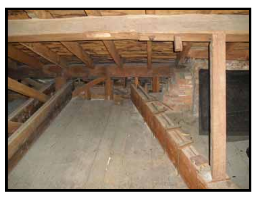
32. LOOKING NORTH. NOTE SCARF JOINT IN TIMBER PURLIN AND NON ORIGINAL BEAMS ABOVE ATTIC FLOOR.