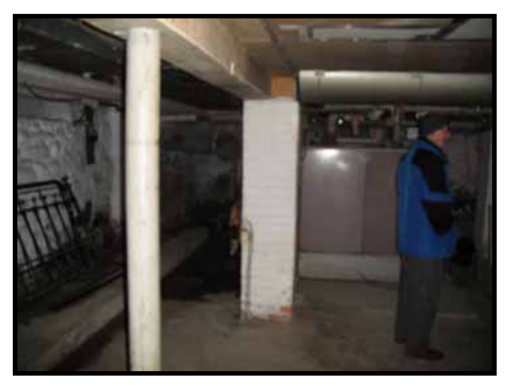
18. PIPE COLUMNS (LIKELY NON ORIGINAL) AND BRICK PIER SUPPORT 8X8 TIMBER BEAM IN BASEMENT.