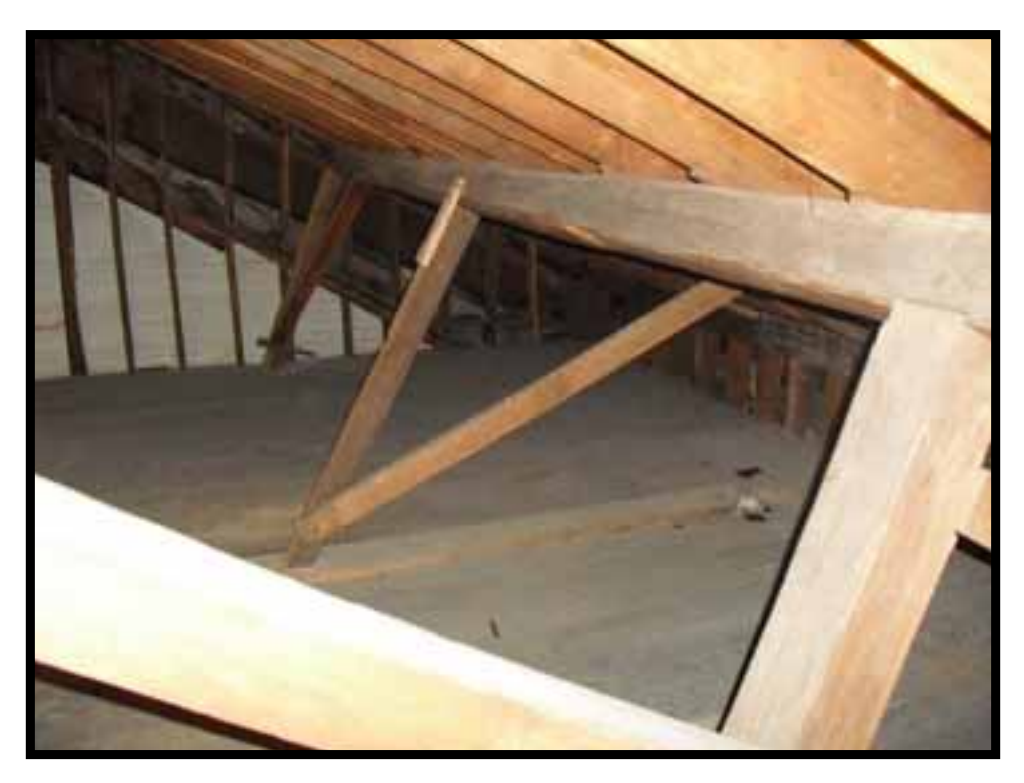
34. LOOKING NORTH WEST AT ROOF FRAMING IN NORTH WEST CORNER OF ATTIC.

33. LOOKING NORTH AT SCARF JOINT IN TIMBER PURLIN.