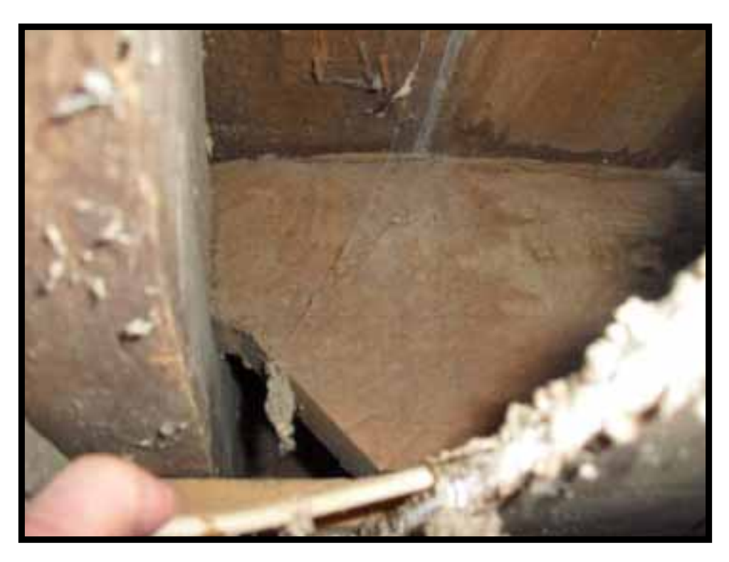
12. JOISTS ABOVE S-W CORNER BASEMENT ROOM MORTISE INTO CENTRAL BEAM.