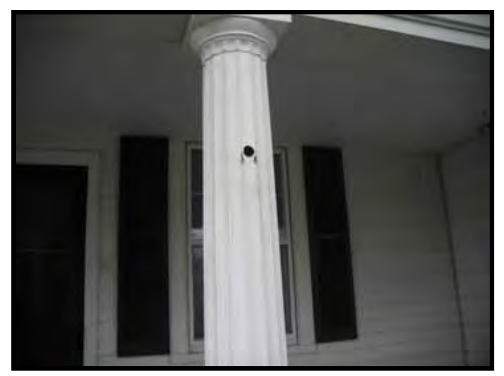
56. TOP OF NORTH PORCH COLUMN.