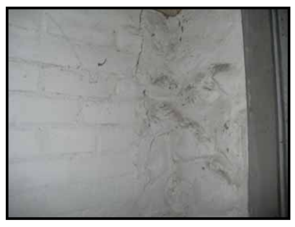
9. CRACKS BETWEEN SOUTHWEST CHIMNEY BRICK AND STONE FOUNDATION WALL.