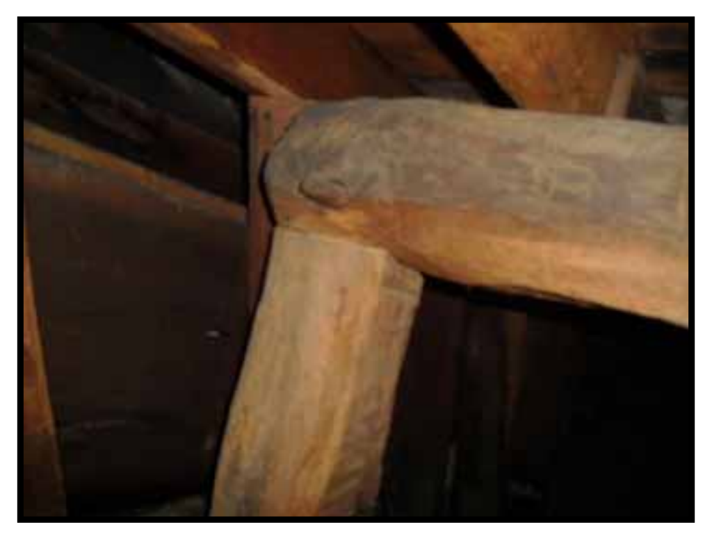
44. PEGGED MORTISE AND TENON JOINERY OF ROOF PURLINS AND COLUMNS.