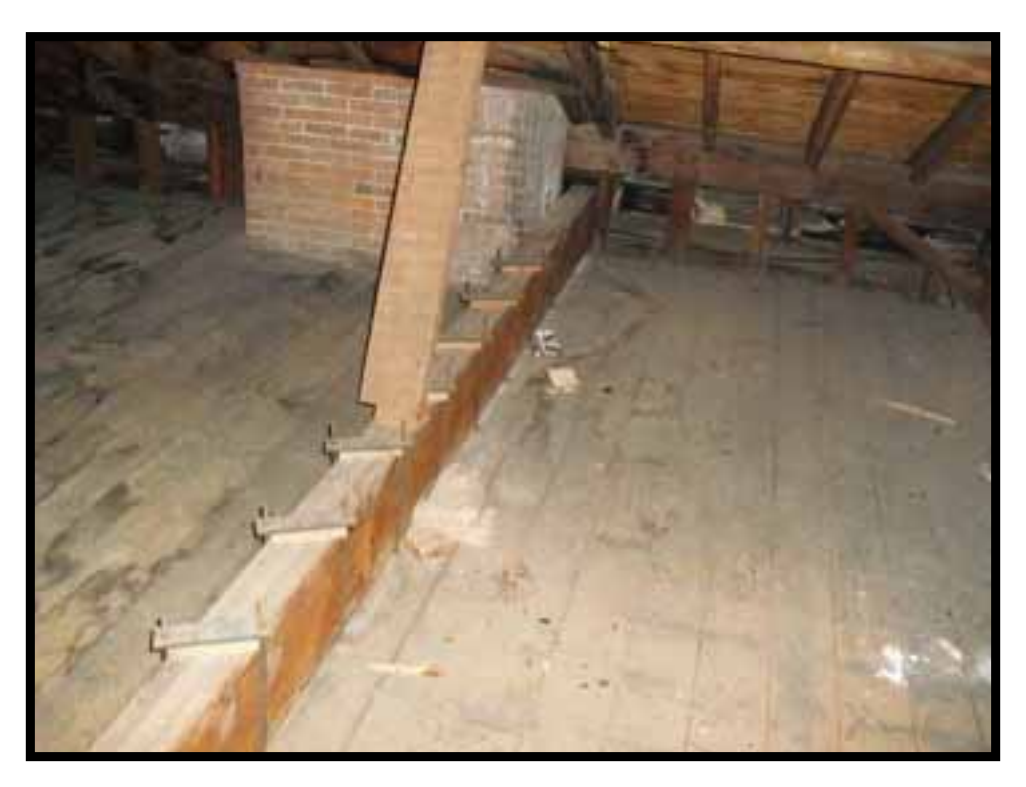
28. NON ORIGINAL BEAM HANGING ATTIC FLOOR AND SUPPORTING SLOPING COLUMN FROM ROOF PURLIN.