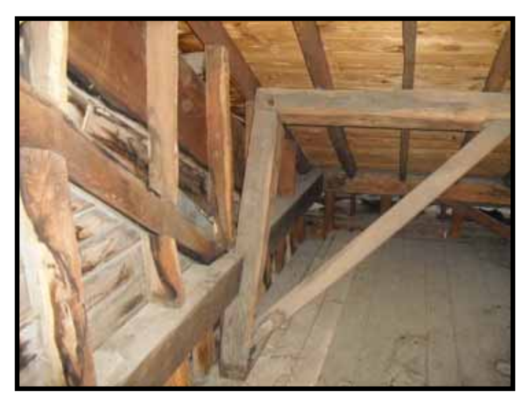
37. DETAIL OF ROOF AND GABLE WALL FRAMING.