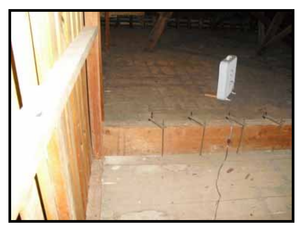
27. NON ORIGINAL BEAM HANGING ATTIC FLOOR STRUCTURE.