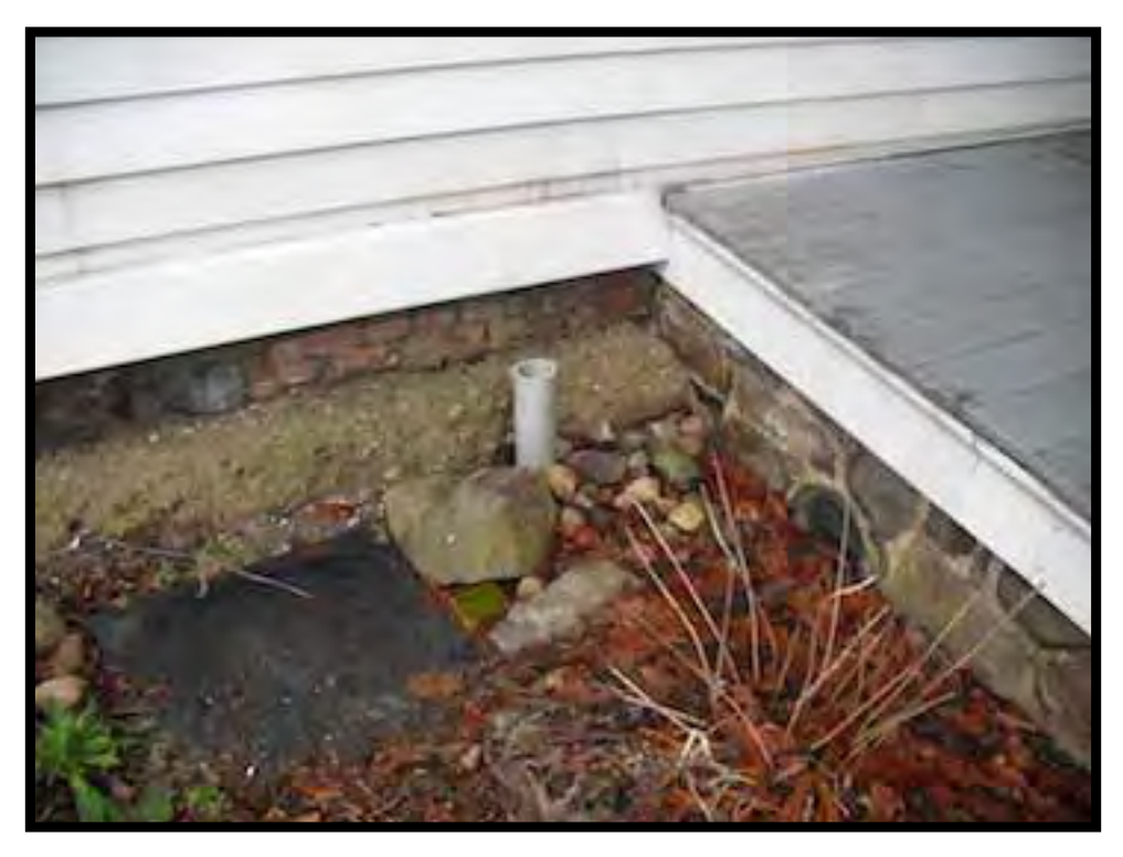
67. SOUTH PORCH AT INTERSECTION WITH SOUTH WEST WING.