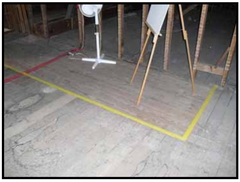
23. OPENING FOR ORIGINAL ATTIC STAIR HAS BEEN FILLED IN AND FLOORED OVER.